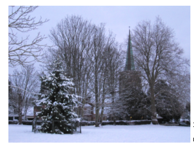
Christmas on Taplow Village Green

If you pay by standing order, please instruct your bank to pay the new subscription from January 1st.